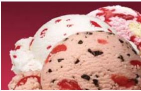
Bars / Ice Cream Parlors / Restaurants