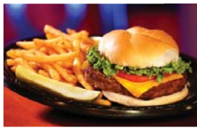
Cafeterias / Table Service / Quick Service