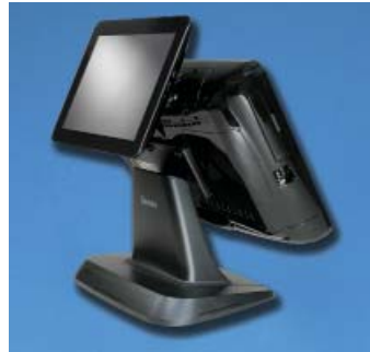
Optional Integrated 9.7" Rear LCD Customer Display