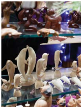
Dollar Stores / Gift Shops