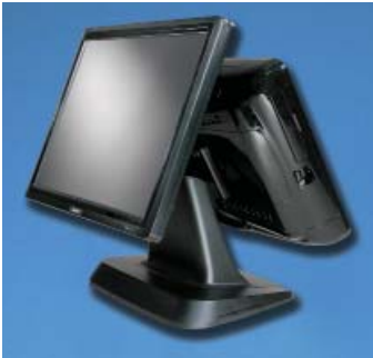
Optional Integrated 15" Rear LCD Customer Display