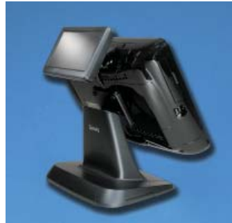
Optional Integrated 7" Rear LCD Customer Display