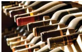
Tobacco Stores / Liquor Stores