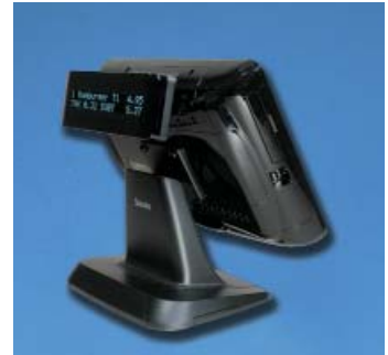
Optional Integrated Rear VFD Customer Display