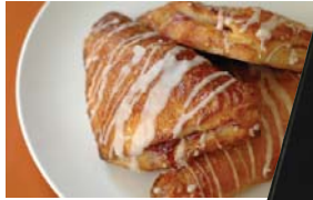
Dusty Environments Like Pizza and Bakeries